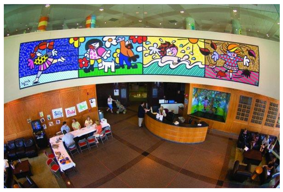
St. Jude Children's Research Hospital – Main Lobby