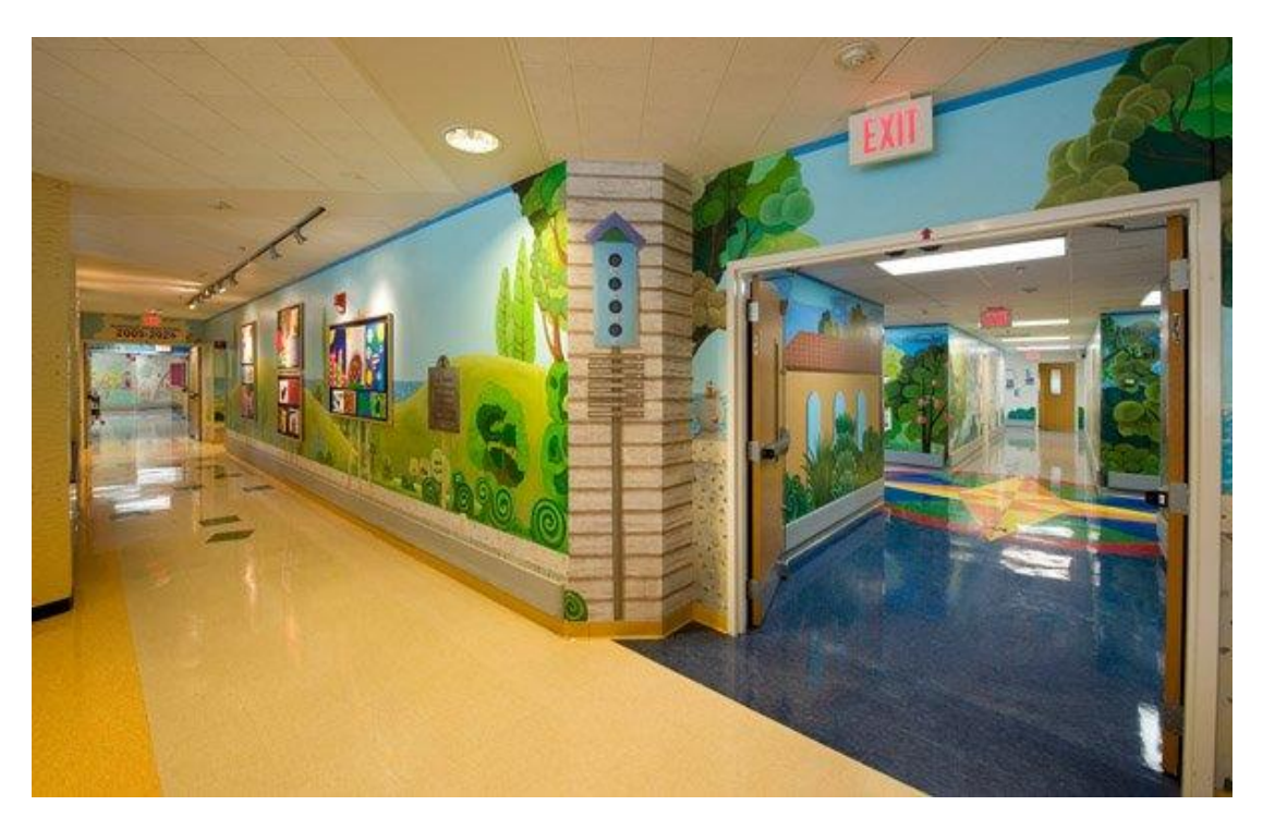
St. Jude Children's Research Hospital - Interior Hallways